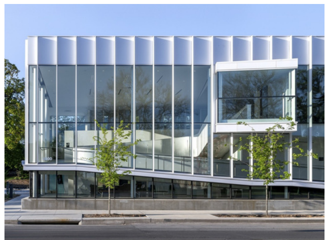
Photo credits: "Cross Park Place," Neumann Monson Architects; "Cross Park Place," Cameron Campbell, Integrated Studios; "Meredith Hall," Drake University Archives & Special Collections; "Harkin Institute," Kelly Callewaert