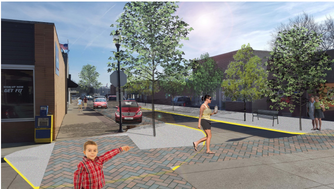
Carlisle Community Design Program