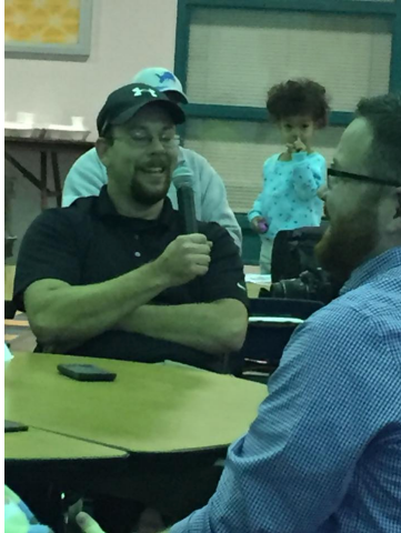
Webster City citizens participate in SWOC analysis prior to the design charrette for a revitalized downtown.

Thank you to the following volunteers who participated with both the 2016 successful design charrettes, promoted the program and helped the committee in creating a new structure for its work: