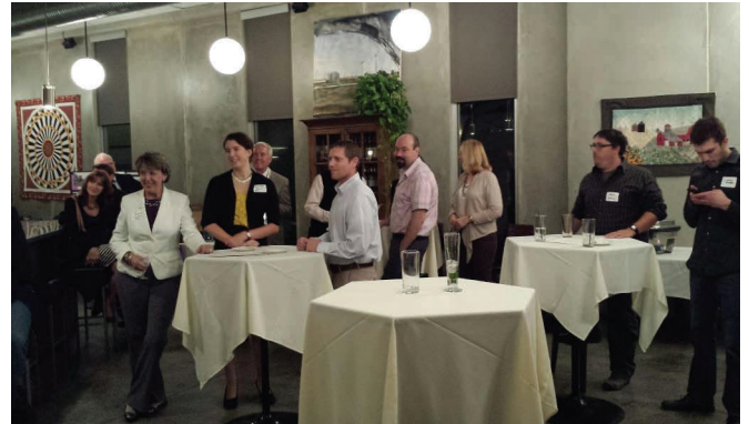
Attendees of IAF's Landmark Party listen to the winners of the Silent Auction.

In September, patrons of IAF's Landmark Party enjoyed a night celebrating Des Moines' historic East Village. The event was sponsored by Denman & Company and FEH Associates. Participants sampled farm-to-table hors d'oeuvres at HoQ restaurant while bidding on a vast array of silent auction items before taking a tour of the East Village and mingling with colleagues and new friends. Both events raised almost $10,000 for the Foundation.