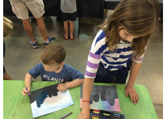
"Skyline Silhouettes" at ArtFest Midwest.

The next goal for the AIS Committee is to update and revamp their ArKIDtec-sure! student programming module by offering a traveling exhibit for libraries and schools with supplemental materials through the IAF website for students to continue interactively learning and engaging in the importance of architecture and design within their community.