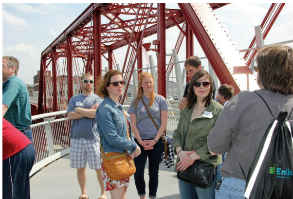
Eat.Drink.Architecture Participants Learn the History of Downtown Des Moines Architecture.

The Architecture in the Community (AIC) Committee continued to be active in promoting public awareness of architecture and design in Iowa. During Architecture Month in April, AIC partnered with judicial buildings for its annual series of free public lectures. The theme was "Architecture for Justice." The Architecture@Hand summer walking tours had another very successful season, with more than 100 participants taking tours led by volunteer architects and intern architects of downtown Des Moines. A number of private walking tours were also given to several community groups and out-of-town groups, making this one of the best years in attendance for walking tours since their inception 13 years ago. IAF was awarded once again a Bravo Des Moines grant to continue in the development of a mobile device to enhance the walking tours.