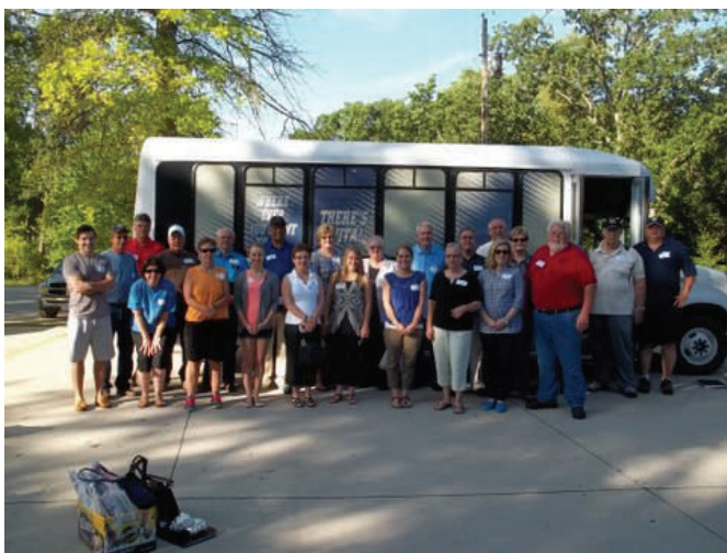
IAF Design Team stand in front of their tour bus with representative from Fremont County.

For the very first time, the Iowa Architectural Foundation Community Design Program conducted a county-wide charrette in the very southwest county of Fremont. In June, a design team of 11 volunteer architects, landscape architects, community planners, and graphic artists took a bus tour of the entire county with representatives from each of the 12 communities. The program wrapped up in November with a final presentation that presented conceptual ideas for county-wide branding and marketing efforts, as well as tourism assessment and suggestions and proper way-finding signage. This community design program was the result of final installment of the Iowa West Foundation grant to IAF. Support for the program came from the Fremont County Tourism Commission and the Keep Iowa Beautiful Hometown Pride Program in Fremont County.