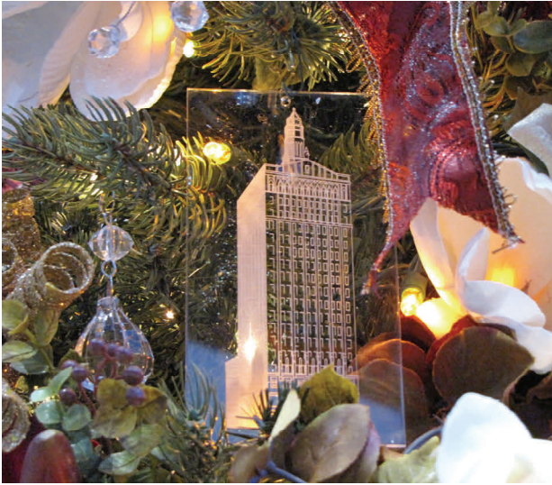
Close-up of IAF 2013 Festival of Trees and Lights Entry Featuring Ornaments of Iconic Buildings of Des Moines Crafted by asi Signage Innovations.

The Architecture in the Community Committee continues to sponsor elementary school walking tours for Central Iowa school districts, private schools, and home schooled children and their chaperones. 140 students participated in 2013. The tours are led by architects, architectural interns, and volunteers interested in architecture that are trained to lead the students on an hour-long “Archi-tective” tour of downtown Des Moines.