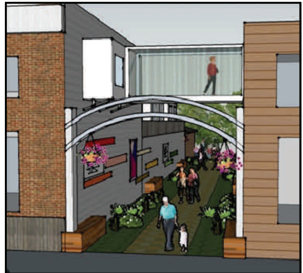
Alley Improvement Concept for Lenox Community Design Program.

The committee continues efforts to wrap up its grant with the Iowa West Foundation to provide design services to the tier counties surrounding Pottawattamie County in the western and southwest regions of the state. Finally, the program continues to evolve with a goal to pilot an abbreviated charrette format designed to assist individual building owners.