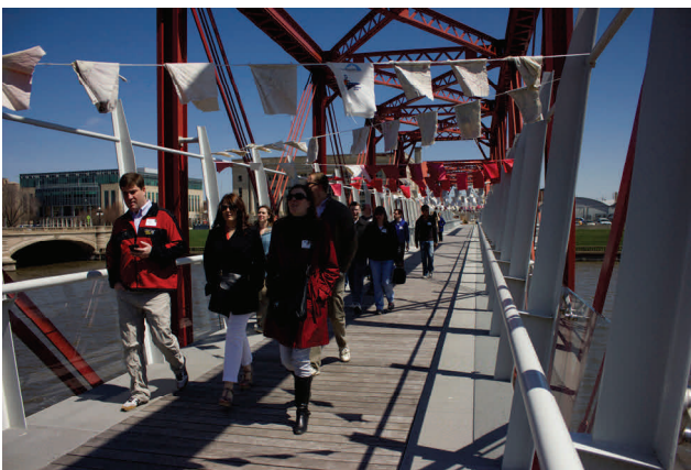
2013 Eat.Drink.Architecture Participants.

The Architecture in the Community (AIC) Committee continued to be active in promoting public awareness of the role of architecture and design in Iowa. One of IAF’s longest running activities: The Architecture @ Hand summer walking tours--given by volunteer architects or architect interns--celebrated its 12th season with 119 public participants. During National Architecture Month in April, AIC continued its annual series of free public lectures on Skyscrapers in Des Moines, including two lectures and one tour of 801 Grand. AIC events were featured as one of the “Top 6 Things to Do in Des Moines” by the Des Moines Register on three separate occasions in April and May. Also in May, IAF was awarded a Bravo Des Moines grant to develop a mobile web site for walking tours.