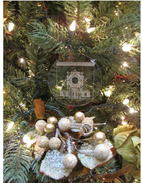
Close-up of IAF 2012 Festival of Trees and Lights Entry Featuring Ornaments of Iconic Iowa Architecture Crafted by asi Signage Innovations.