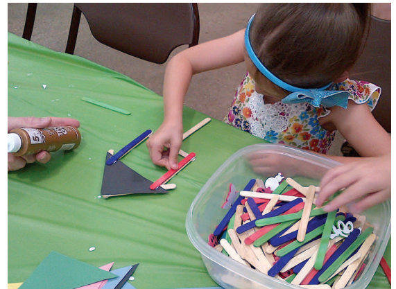
“Birdie Abodes” Construction at ArtFest Midwest.

AIS saw growth in 2012 with new members. Ideas for new programs are currently in the works for 2013.