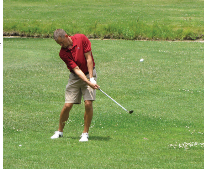
A Beautiful Day on the Links at Willow Creek Golf Course in West Des Moines for the 8th Annual IAF Golf Outing.

The Board of Trustees sponsored two fundraising events. The 8th annual golf outing was held in June at the Willow Creek Golf Course in West Des Moines. Seventy two golfers enjoyed an afternoon on the links. In September, patrons of IAF's Landmark Party enjoyed a night touring Hoyt Sherman Place in Des Moines.