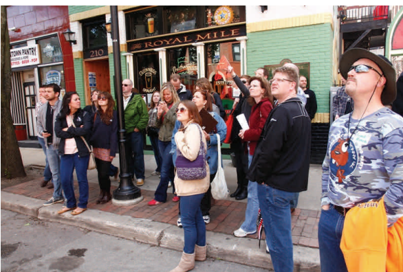
Eat.Drink.Architecture Participants Learn the History of Downtown Des Moines Architecture.

The Architecture in the Community (AIC) Committee continued to be active in promoting public awareness of the role of architecture and design in Iowa. One of IAF’s longest running activities: The Architecture @ Hand summer walking tours--given by volunteer architects or architect interns--celebrated its 10th season with 125 public participants.